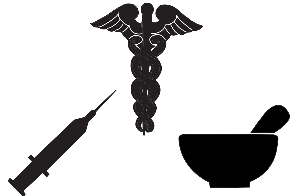
Conventional and sometimes addictive medicines.