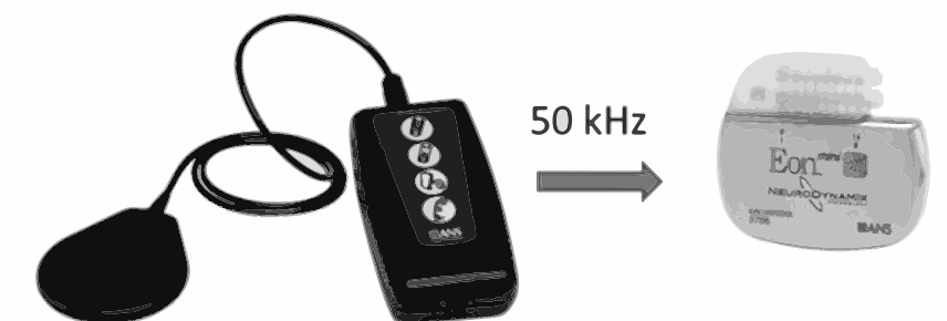
Charger unit and battery.