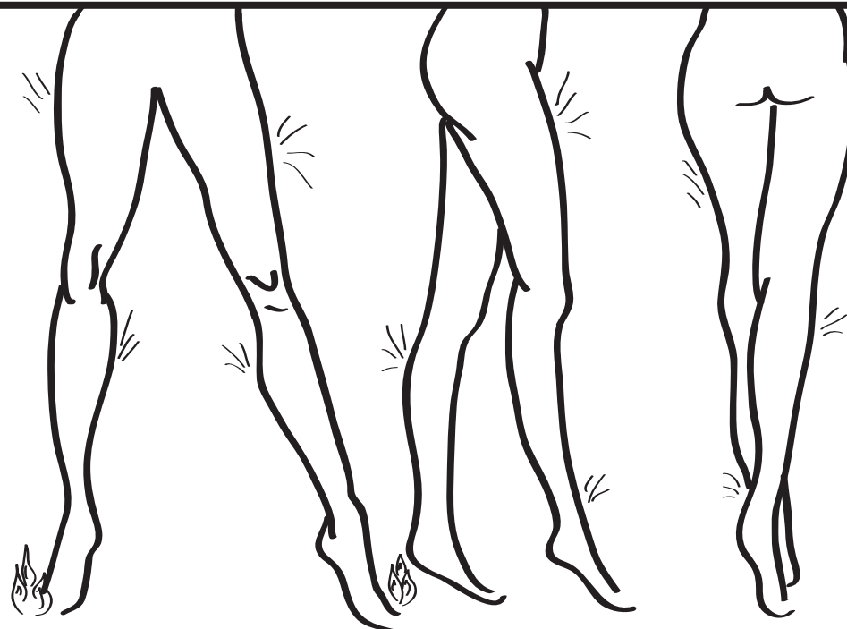
Leg pain from nerve damage. Stabbing, throbbing, aching, and burning sensations.