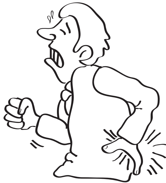
Lower back pain.